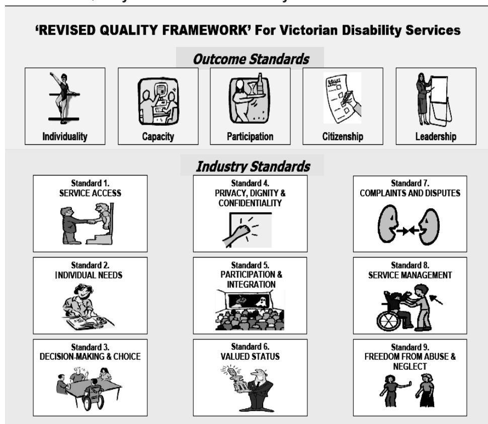
Figure 4A Quality Framework for Disability Services in Victoria